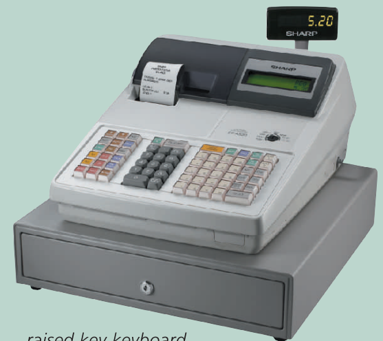
raised key keyboard ER-A520