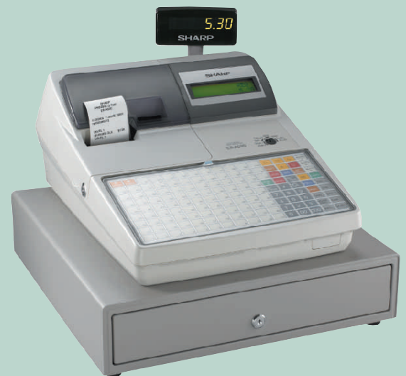
flat, spill-proof keyboard ER-A530

Customizable keyboards to suit your environment